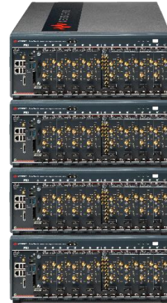
Figure 1: A modular and scalable control system hardware