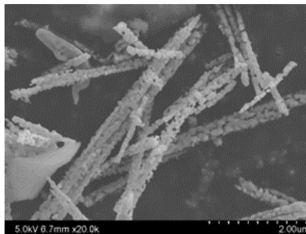
Figure 2: SEM image of catalyst (No. 3) after CO 2 hydrogenation process.