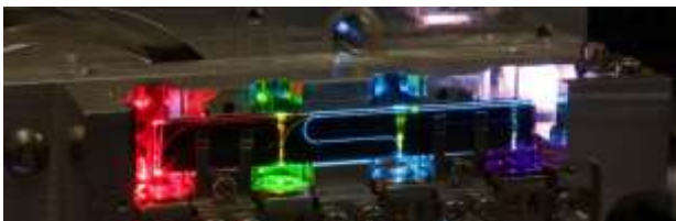
Figure 2. Example of laser light combiner from TOPTICA Photonics AG & Chair of integrated photonics, RWTH Aachen University