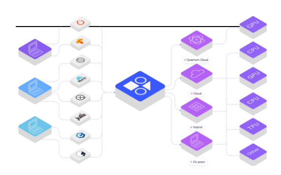
Figure 1: Users of quantum & HPC must work in a complex landscape due to numerous hardware modalities & software frameworks. To reduce effort & costs, users abstract away that complexity via a single interface, unifying hardware types, instances, environments & languages.