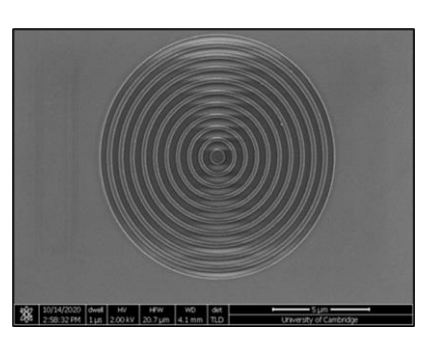
Figure 1: Example of hybrid CBG fabricated on a semiconductor slab.