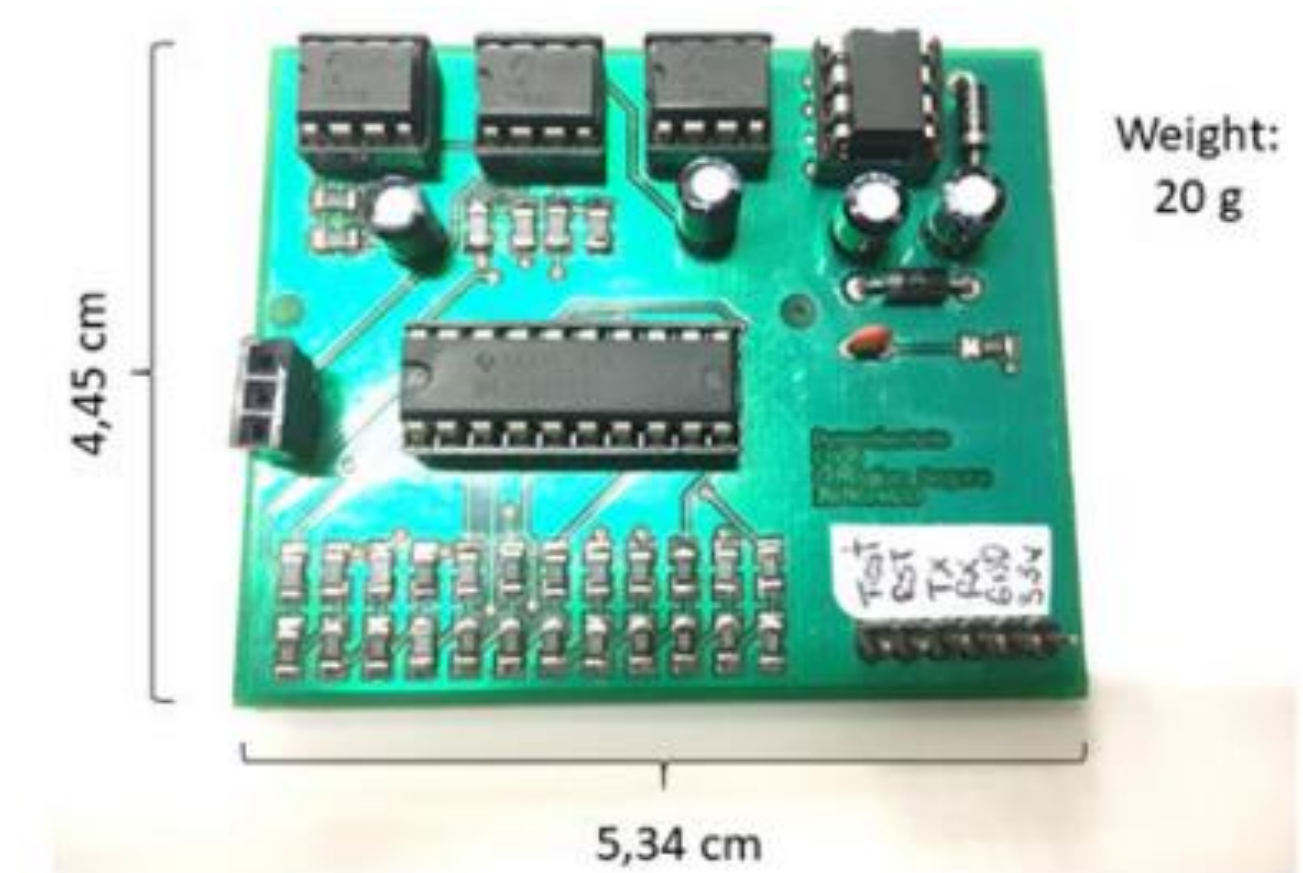
Fig. 1 Portable potentiostat

These results were achieved by the change of impedance magnitude that occurs when the virus binds to the antibody. Therefore, or device features such as portability with dimensions of 4,45cm x 5,34cm and 20g of weight; needs a low power supply from 3,3V, had a working voltage range from -1,65 V to 1,65 V, a scan rate of 12 mV/s and a current Range 80uA to 10mA. Also, has UART-USB communication, and update speed of 60ms.