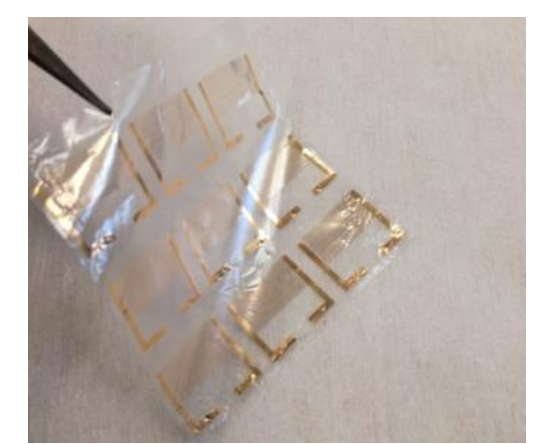
Figure 2. Graphene biosensors printed on polymer .