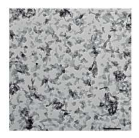
Figure 1: TEM image of synthesized nHAp.