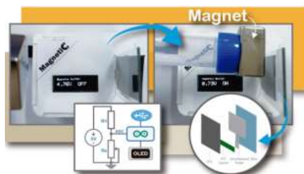
Figure 2: Schematic representation of the magnetic actuator and the corresponding electronic circuit.