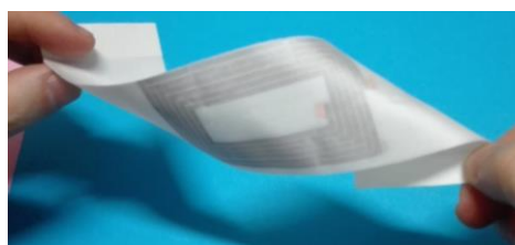
Figure 2: Wearable NFC bracelet